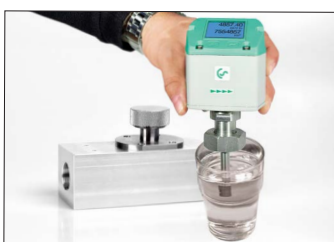
The sensor can be removed from the measuring block and cleaned