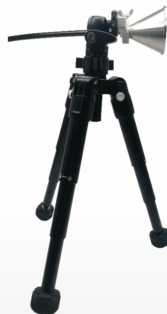
Isokinetic sampler with stand and hose